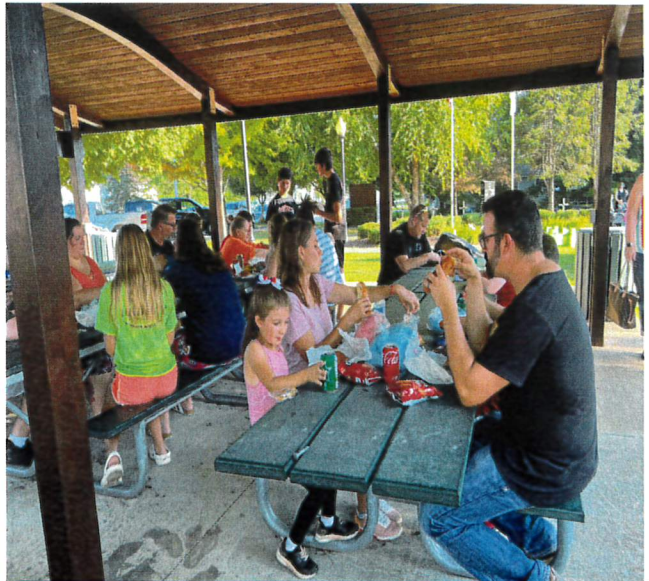
Winning Wheels team member picnic