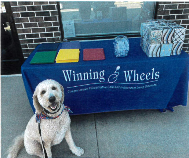
Prophetstown school supply give away