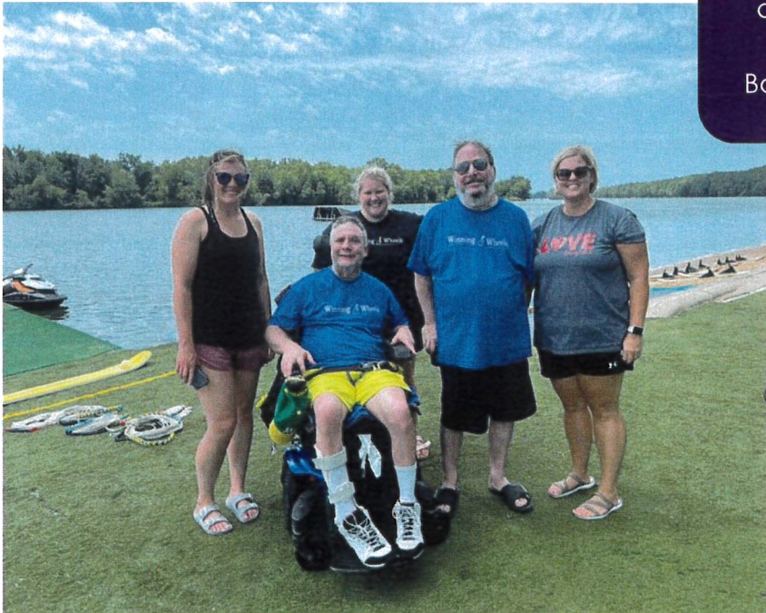
Winning Wheels staff and residents water skiing with the Backwater Gamblers!